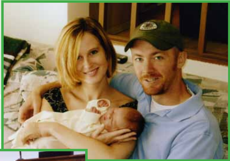
We meet our new nephew