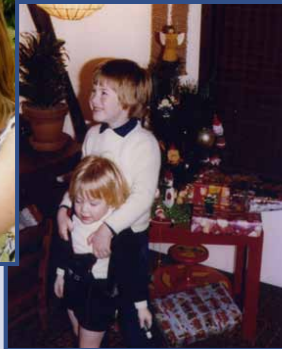
A childhood Christmas