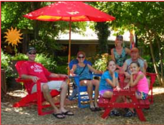
A summer family gathering