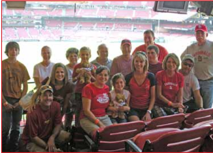
Gathering with friends and family at the ball game