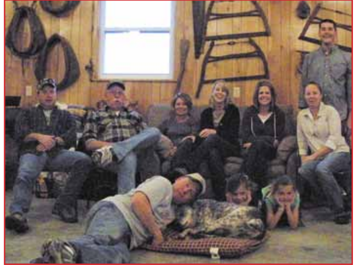
Our families together