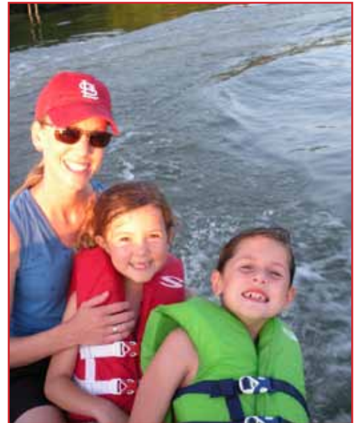
A day at the lake with the nieces