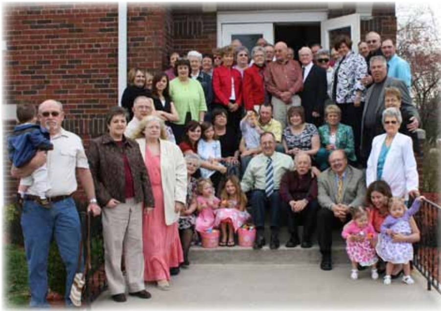
Family together for Easter Sunday