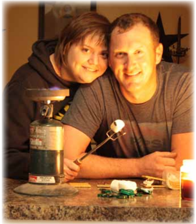
Making s'mores during a blackout