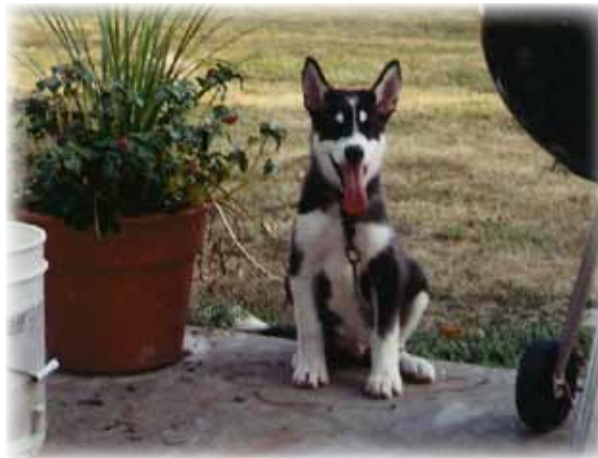
Hutch as a puppy